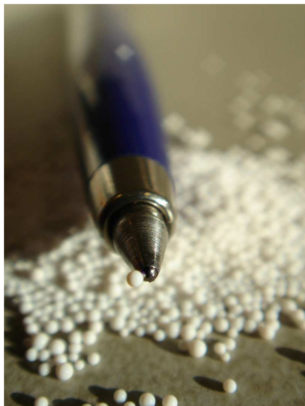
Immobilized enzymes are easy to handle.

Since only a dozen immobilized enzymes are used as catalysts in diverse industrial processes, only a few enzymes are commercially available in immobilized form. The most well-known one used in diverse chemical applications is NZ 435 produced by Novozymes which is Candida antarctica lipase B absorbed on macroporous beads. This product has become an industrial standard over the years. For the production of antibiotics covalent immobilized penicillin G acylase has been used for over decades. Few others are available, most of them are exclusively used in food processing like immobilized glucose isomerase for the continuous production of fructose syrup. This has forced some chemical producing companies to immobilize enzymes themselves: although both the enzyme and the carrier are available on the market, no immobilized enzyme “to-go” can be obtained.